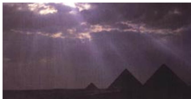
2. LOWER LEFT AND ABOVE: The three pyramids of Giza were built on the same proportional scale and geometry as their celestial counterpart; the three major stars of the Orion constellation.