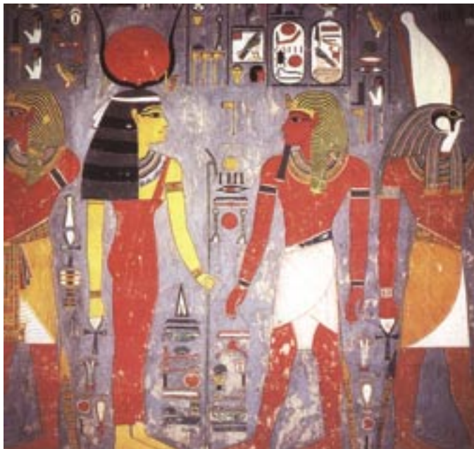
1. ABOVE LEFT: From the New Kingdom onward, Egypt's two greatest goddesses were often portrayed virtually identically, to the extent that they could almost be regarded as manifestations of a single goddess, Isis-Hathor. This representation of the goddess in her Hathor aspect comes from the beautifully carved and painted tomb of King Horemheb.