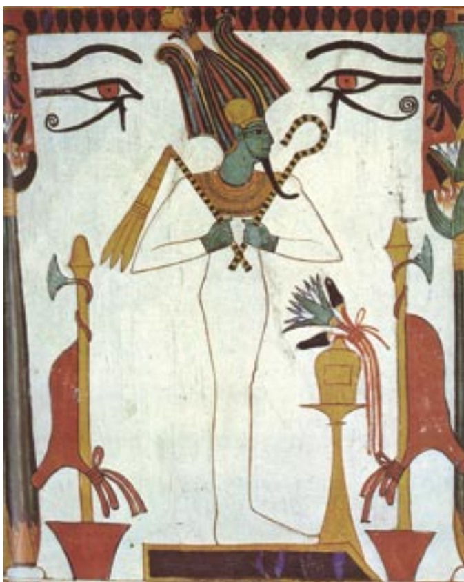
BELOW LEFT: In another detail of the tomb, the picture of Osiris, portrayed here with his body wrapped in a winding sheet, his hand and face colored green to symbolize reborn vegetation. The god is holding a pastoral crossed with a whip, a symbol of royal power. On his head he is wearing an atef, or crown formed by intertwined rushes that ends with the solar disk flanked by two feathers. On both sides of Osiris, two idols of Anubis represented by two animal hides hung from a stick.