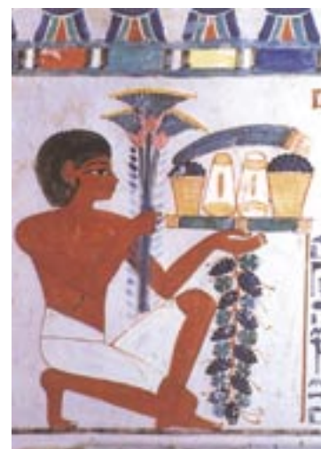
3. RIGHT: Nakht. Tomb of the "Scribe and astronomer of Amon" in the time of Thutmose IV, in Qurnah. Beautiful scenes (from which the name of Amon was scraped away during the Atonian "heresy"), above all those of the cultivation of grain, the grape harvest, hunting and fishing. The kneeling offering bearer: in his right hand he holds a bunch of flowers, in his left a branch with bunches of grapes and a tray with sweets, vegetables and fruits.